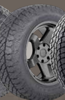
RANGER A/T R