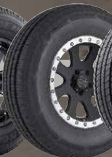
RANGER COMMERCIAL LT