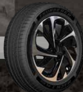
MACH I PLUS