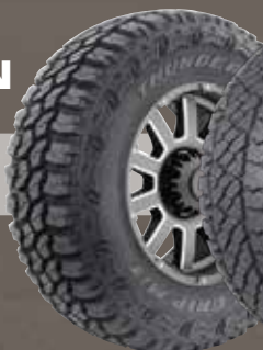
TRAC GRIP M/T